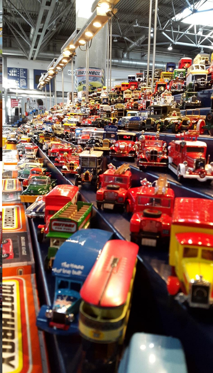
Some impressions of the equipped stalls & other parts of the whole fair!