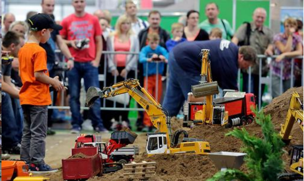
Some more impressions ... need more – just ask Google for Modell Spiel Hobby 2015