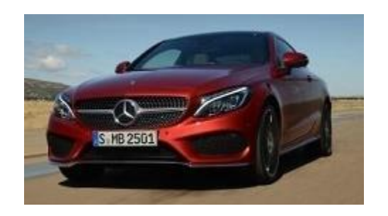
2016 Mercedes C-Class Coupe