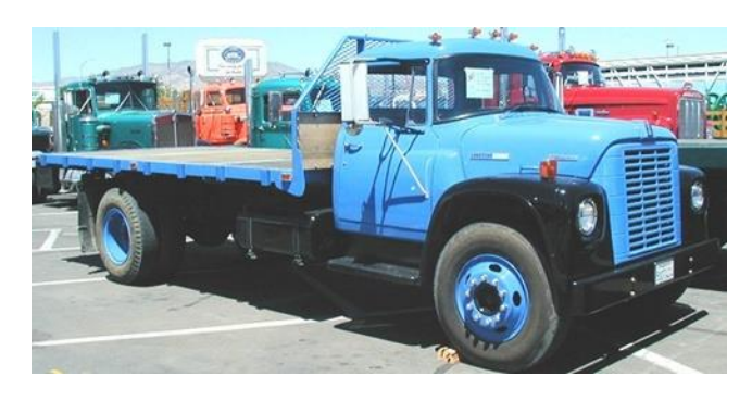
1968 International Loadstar 1600