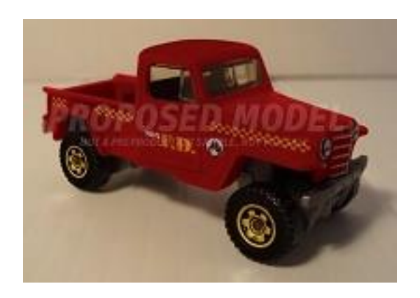
1953 Jeep Willys MBX Fire Dept.