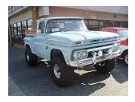
1963 GMC Stepside