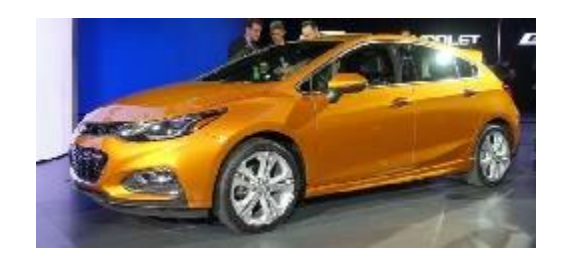
2017 Chevy Cruz Hatchback