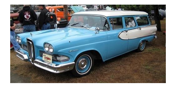
1958 Edsel Villager