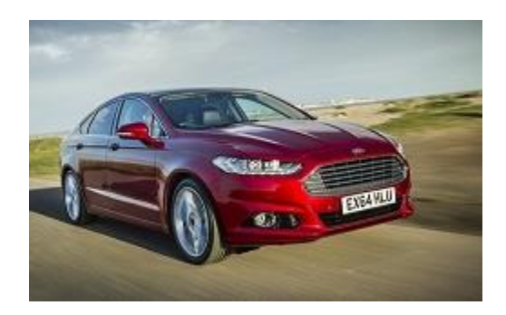
2015 Ford Mondeo Ecoboost