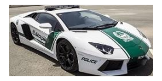
Lamborghini Aventador Policia