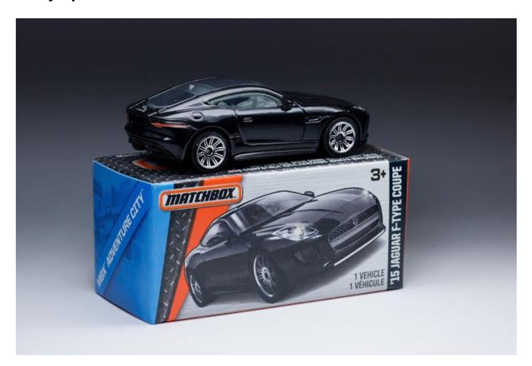
Also the Best of models are available now!

Problems with the distribution of the models are always a core topic. Rumors are that Target is dropping the standard models on blister cards – lets cross the fingers that it is only for the boxed version – these boxes do come out very good in my opinion!