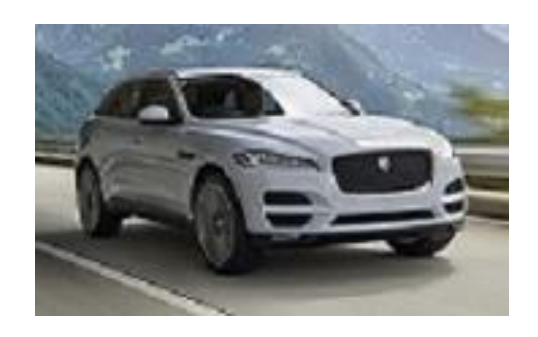
2016 Jaguar XF