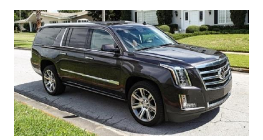
2017 Cadillac Escalade ESV Platinum