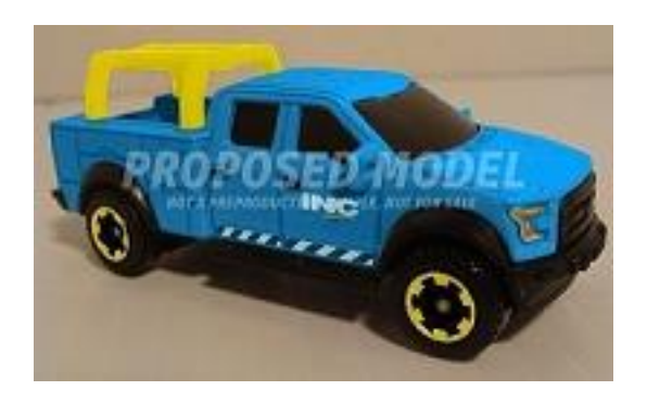
2015 Ford Contractor Pickup INC.