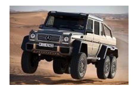
Mercedes G63 AMG 6x6