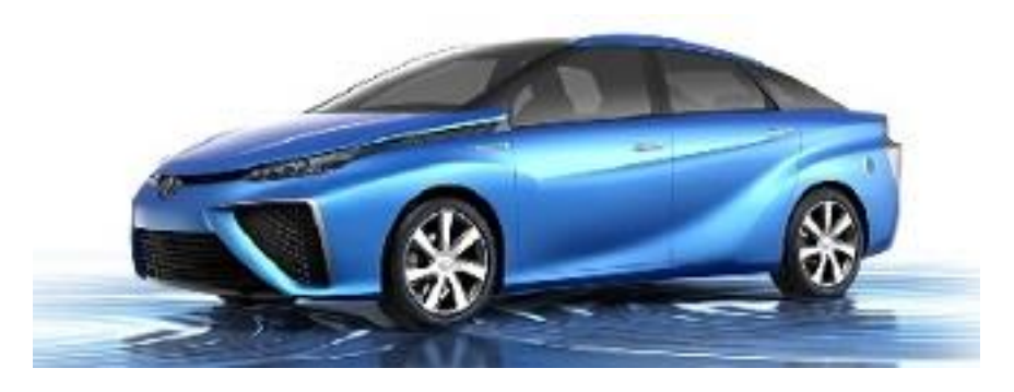
2015 Toyota FCV Concept