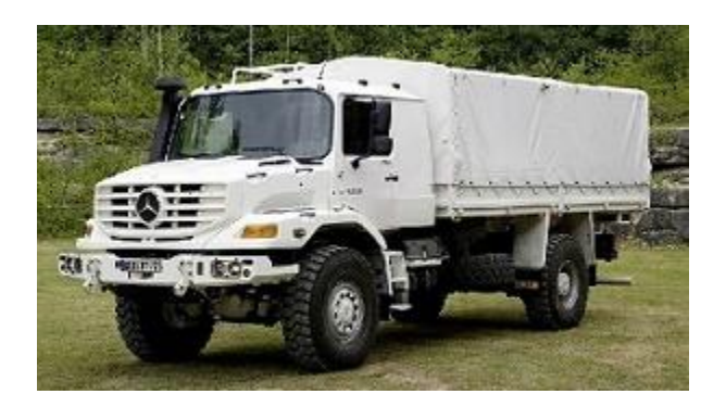
Mercedes-Benz Zetros 1833