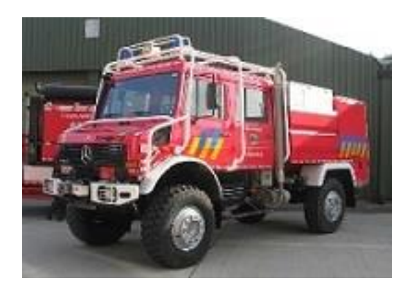
Mercedes Unimog Fire Truck