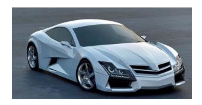
2014 Mercedes-Benz SF-1 Concept