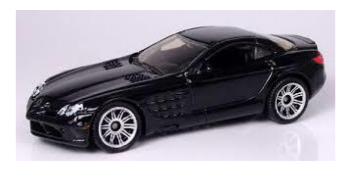
Mercedes-Benz SLR McLaren