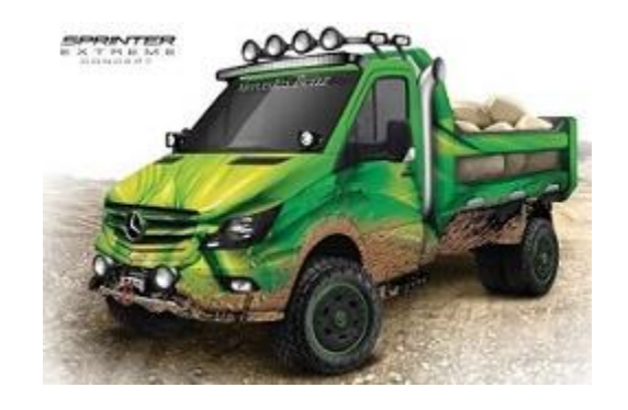
Mercedes Sprinter Extreme Concept