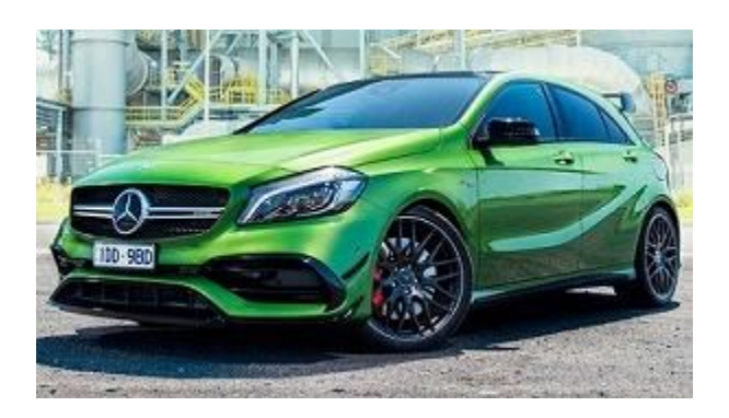
2016 Mercedes-Benz AMG A45