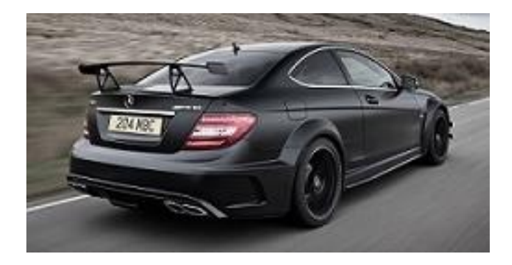
2015 Mercedes-Benz C63 AMG Black Series