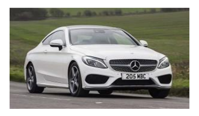
Mercedes C-Class Cabriolet