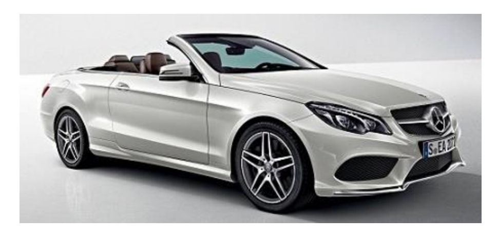
2014 Mercedes-Benz E-Class Cabriolet