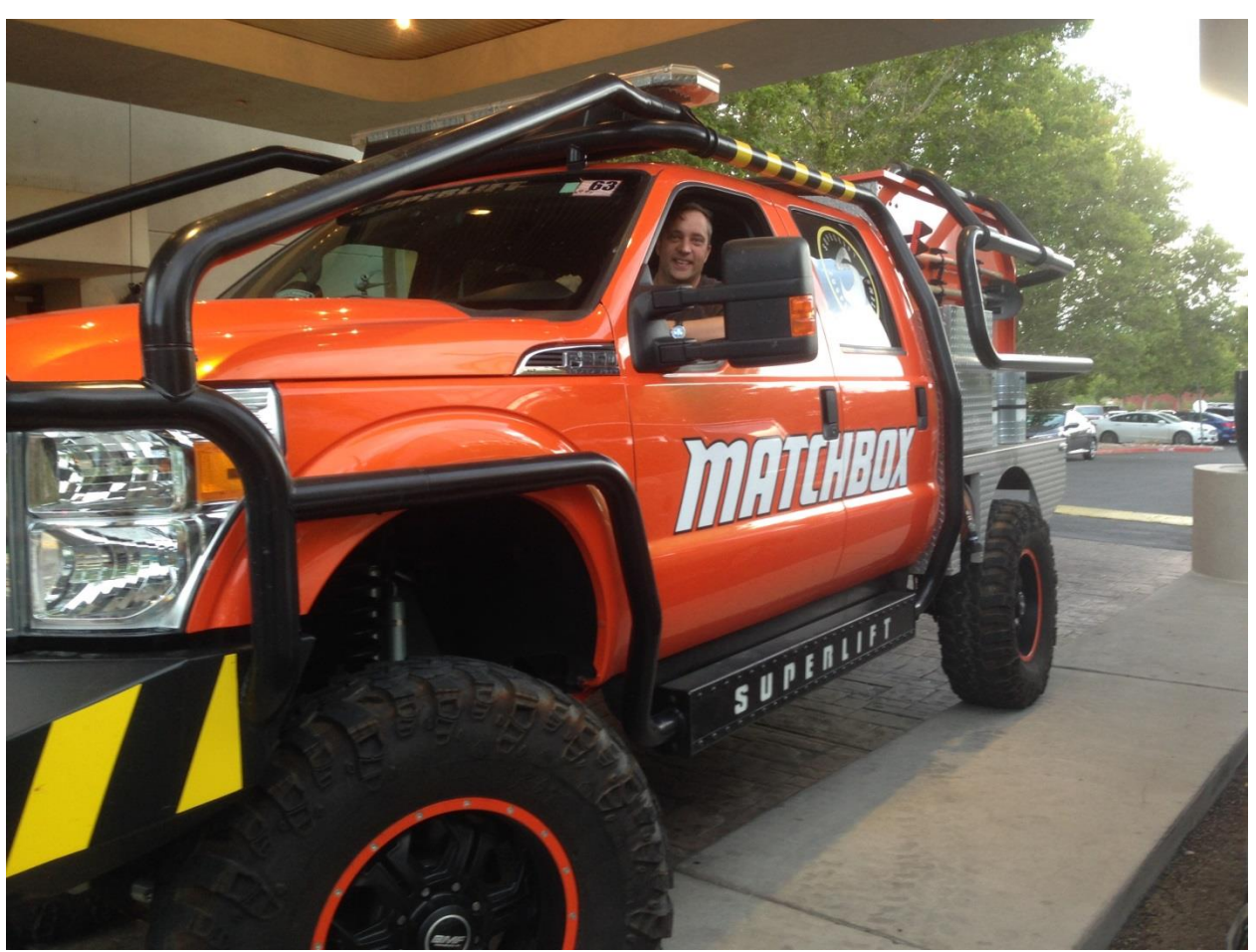
Hello Matchbox friends all over the world!

this is my (final?) report after the Albuquerque Matchbox Gathering – it was really good fun and I'm surely coming back in 2017 – 21-23 July ! C U there !!!